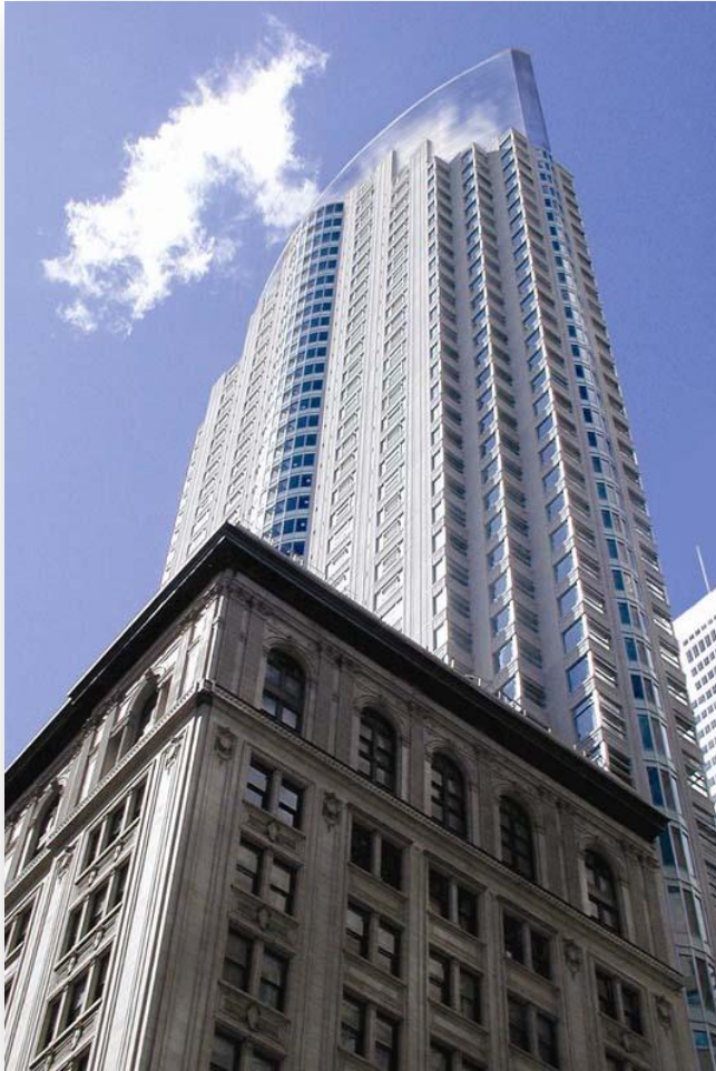
One King West